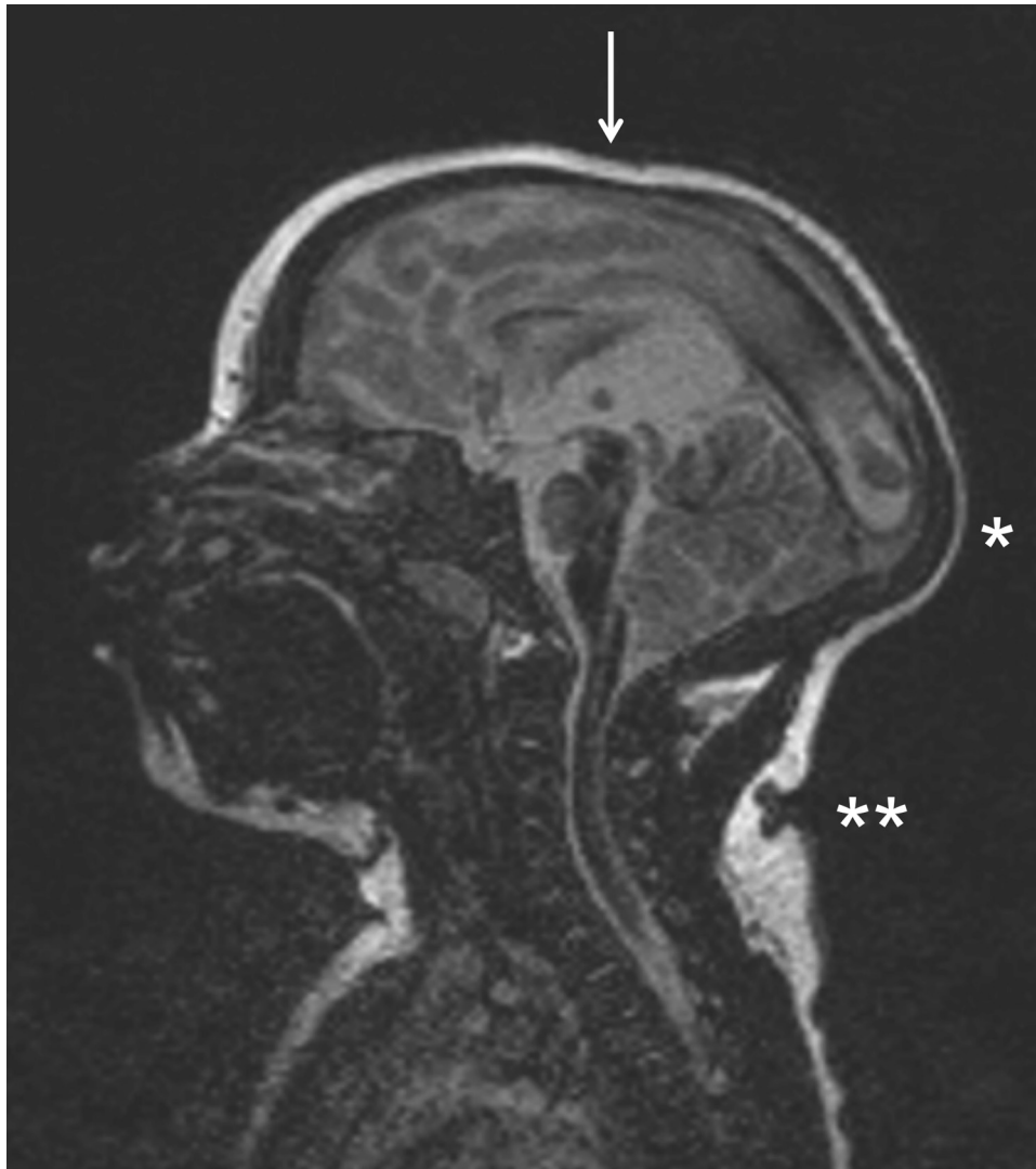
FIG 1 Sagittal MRI image of the head of an infant who was born with a head circumference below the third percentile (microcephaly), under investigation. The arrow shows a collapse of the skull, inducing cranio-facial disruption, an exuberant external occipital protuberance (*), and redundant scalp skin (**).

or neurodevelopmental delay and 43% suffered from epilepsy (21). These results are congruent with findings of another study in which only half of the children with microcephaly had a normal intelligence quotient (IQ) (31). The severity of the neurological impairment seems to be associated with the severity of microcephaly (32). Given the above, the prognosis may be poor for suspected ZIKV microcephaly cases due to a potential early insult to brain development and systemic involvement, depending on the timing of infection. Long-term studies are urgently needed to characterize the prognosis.